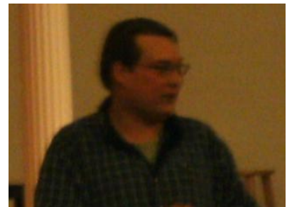
St. John of Vercelli