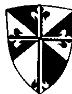
Venerable Fulton J. Sheen

"My journey began with wanting to be a member of a Catholic group devoted to spirituality. When I learned of the importance of study to the Order of Preachers I knew that I had found a home. I've always been somewhat of a bookworm and here was a group that took up learning as its work to the glory of God. I cannot express how happy I am to be on the path to full profession and hope to add what little I am able to what St. Dominic, St. Thomas Aquinas, St. Catherine of Sienna, Bl. John of Vercelli and so many others have started and continued."