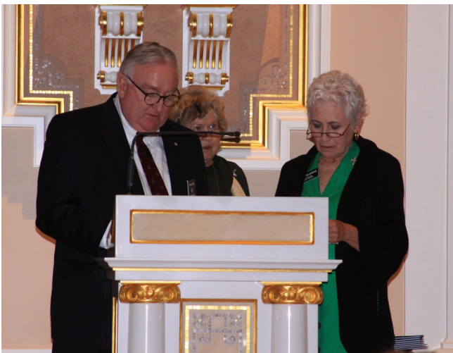
Chapter President (forefront) and Vice-President (in background) witness a profession

As is customary, those making their Temporary Profession choose a religious name both as a way of honoring that saint and as a model of saintly life to which they will aspire.