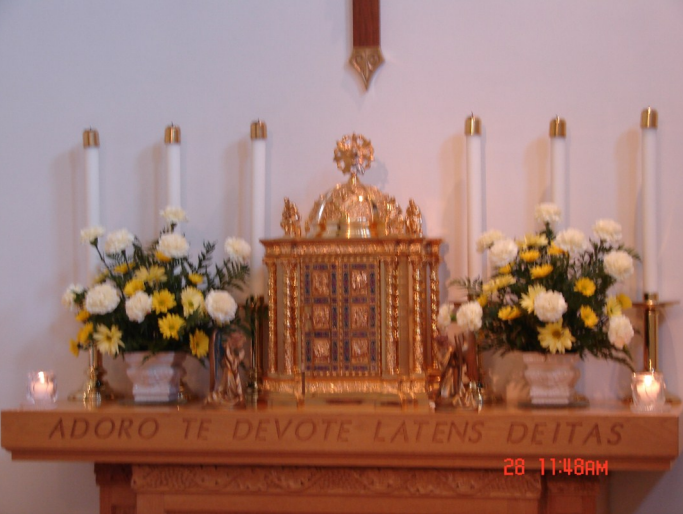
"We Adore the God Who is Hidden"