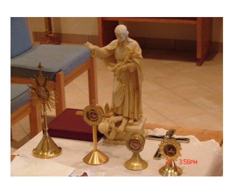
A Few of the Dominican Relics