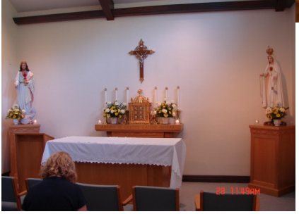
Altar of Repose