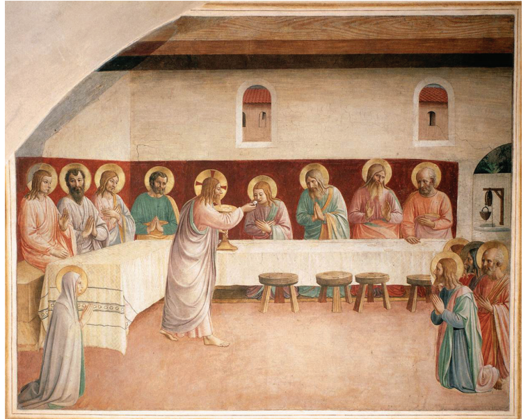
Institution of the Eucharist by Fra Angelico (1442)