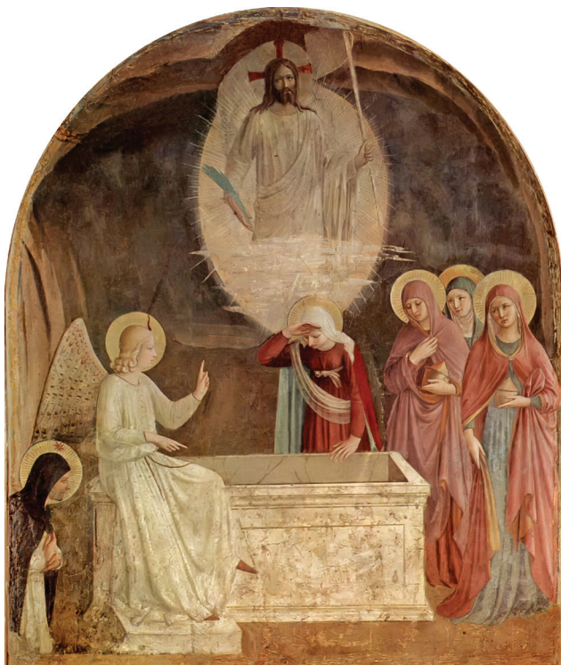
Resurrection of Christ and Women at the Tomb by Fra Angelico (1442)