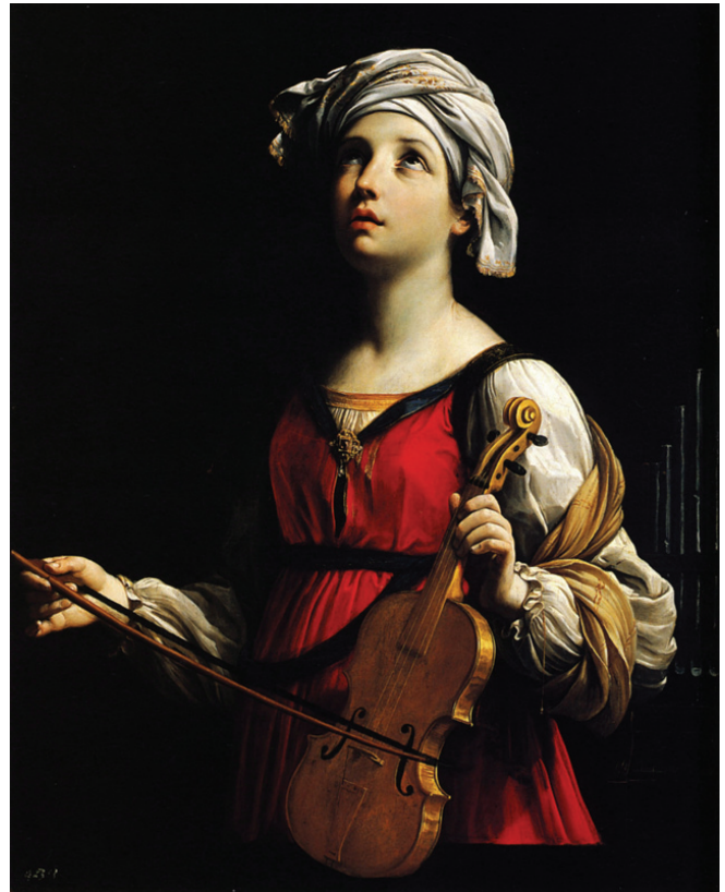
St Cecilia by Guido Reni (1606)