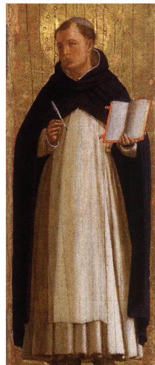
St Thomas Aquinas by Fra Angelico (1440)