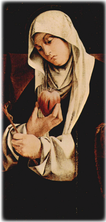
Selection of the Altar of Recanati polyptch (1508) by Lorenzo Lotto featuring St Catherine of Sienna.