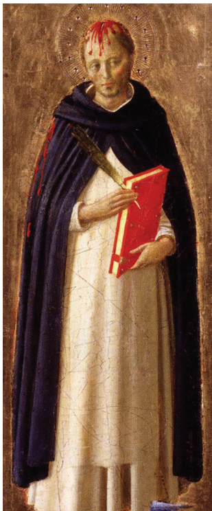
St Peter Martyr by Fra Angelico (1440)