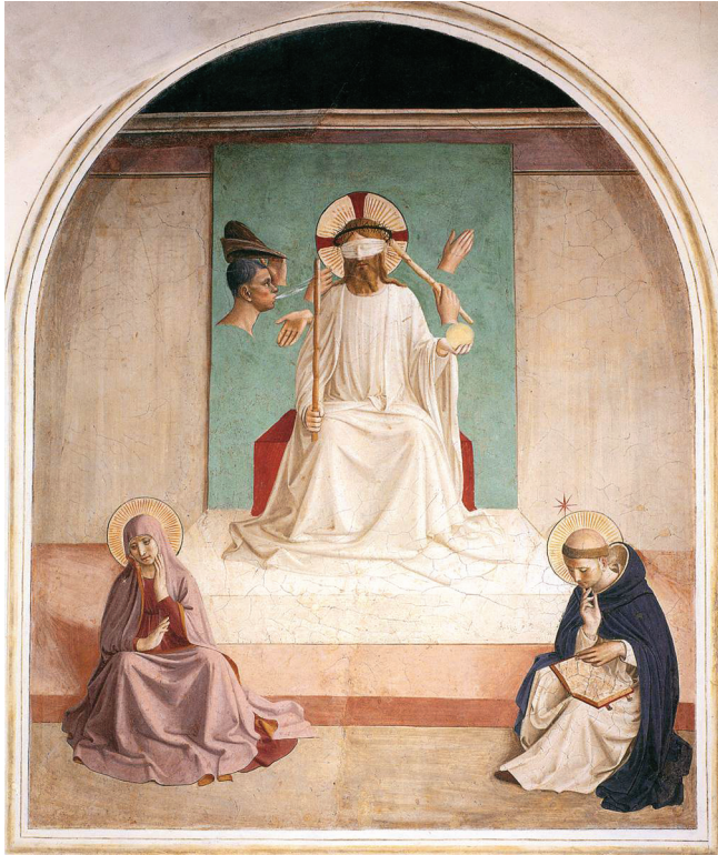
The Mocking of Christ by Fra Angelico (1435)