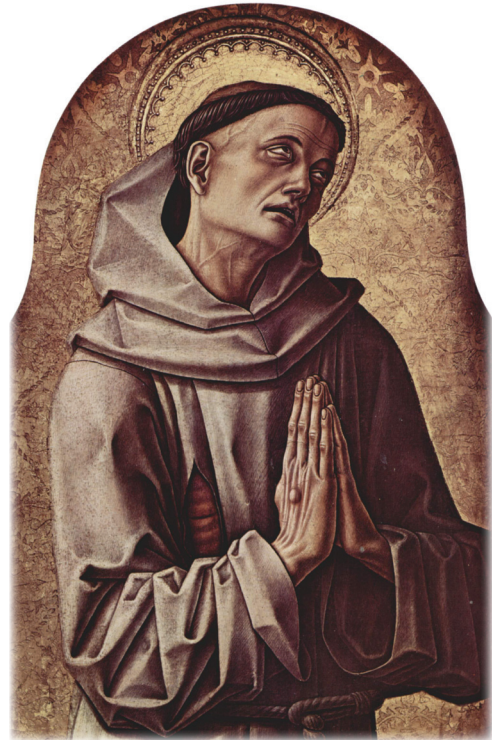
St Dominic by Carlo Crivelli (1476)