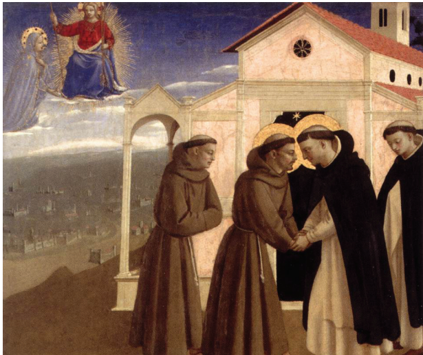
The Meeting of St Francis and St Dominic by Fra Angelico (1429)